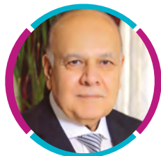
Amr Ezzat Salama

Secretary General, Secretary General, Association of Arab Universities-AARU Former Minister of Higher Education, Scientific Research and Technology of Egypt