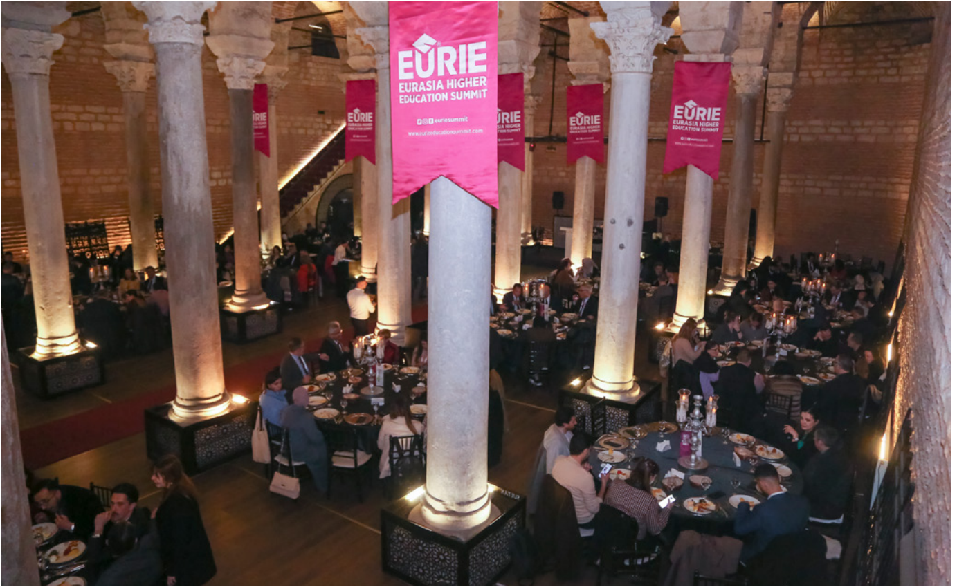
EURIE 2023 Turkish Night