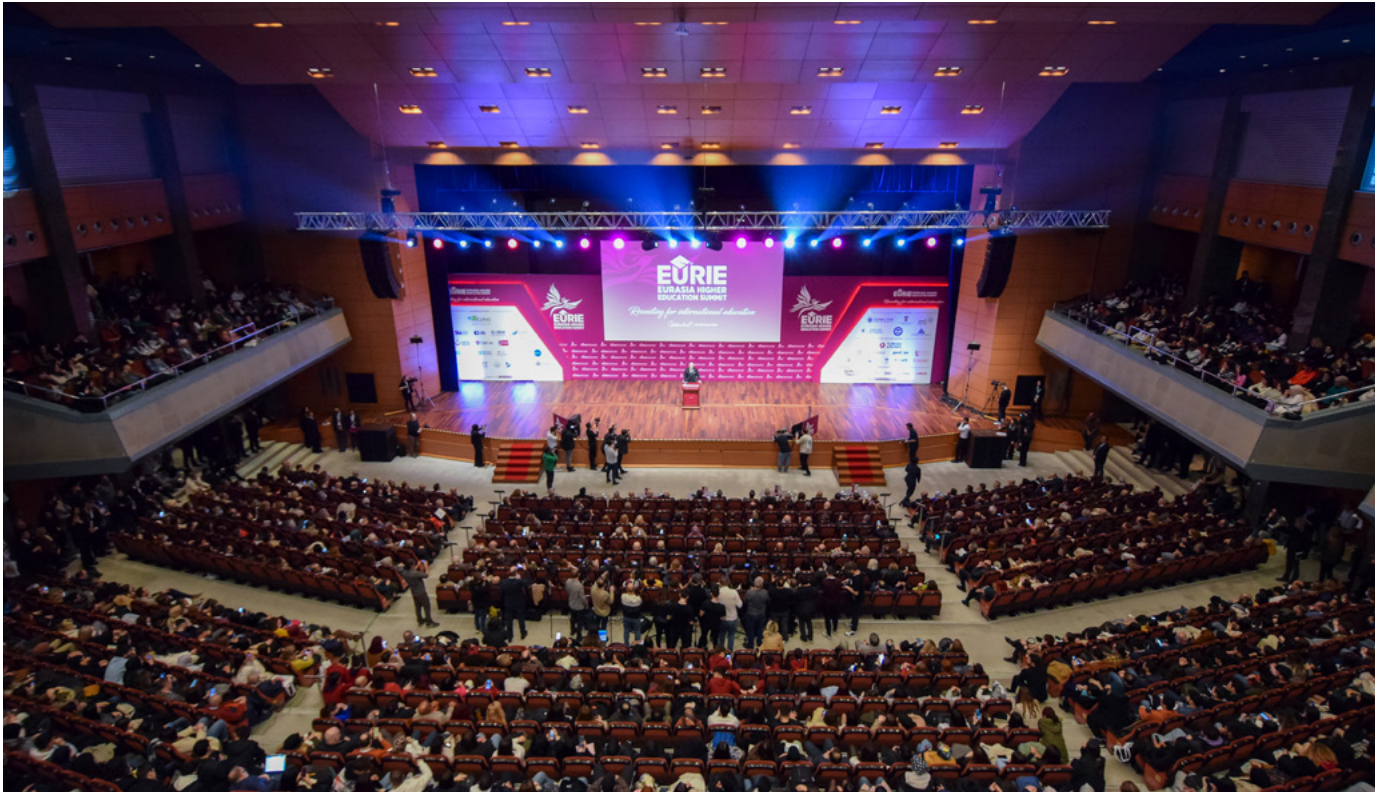
EURIE 2023 Opening Ceremony