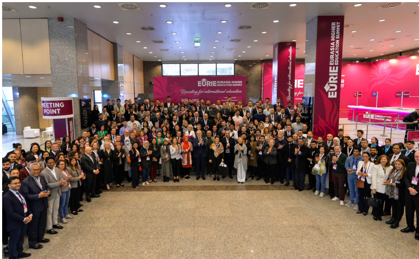
EURIE 2023 Closing