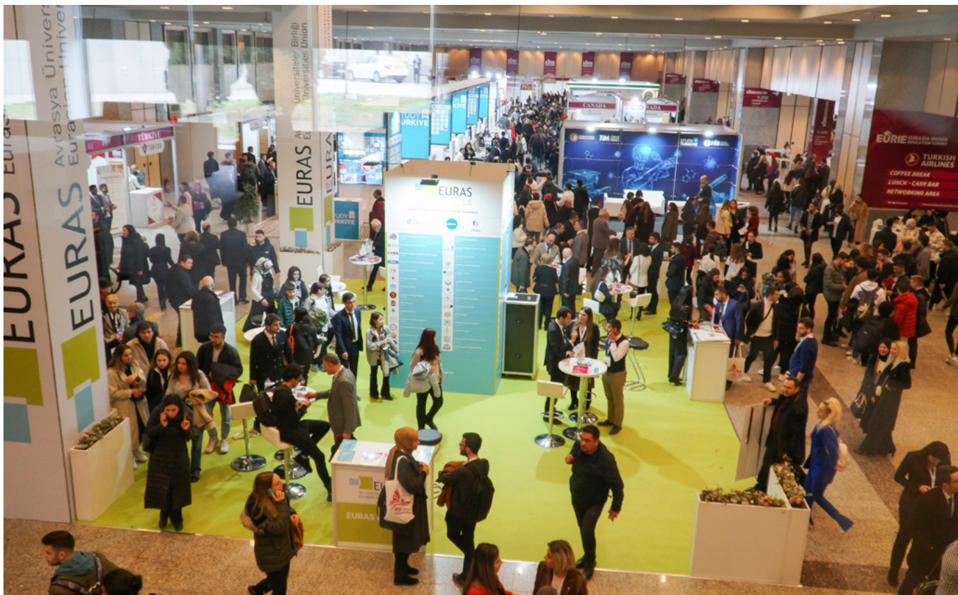
EURIE 2023 Exhibition Hall