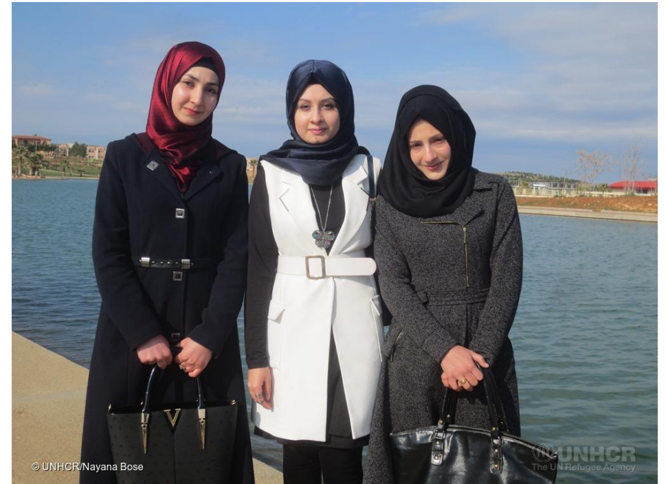
Three Syrian refugee scholarship holders in Sanliurfa